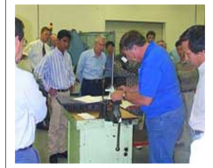
Seminar attendees learning to assemble a 225-II Yarn Carrier with Technical Service Representative.

Hotel reservations will be arranged by Magnatech at The INN at Reading, 1040 N. Park Road, Wyomissing, PA 19610. A limited number of discounted hotel rooms have been made available for this event at the corporate rate of $83.00 per night single/double occupancy. These rates are subject to 6% sales tax and 5% local hotel occupancy tax. All hotel rooms are non-smoking. Guest check-in time is 3:00 p.m. and check-out time is 11:00 a.m.